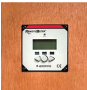
In Wall Mount